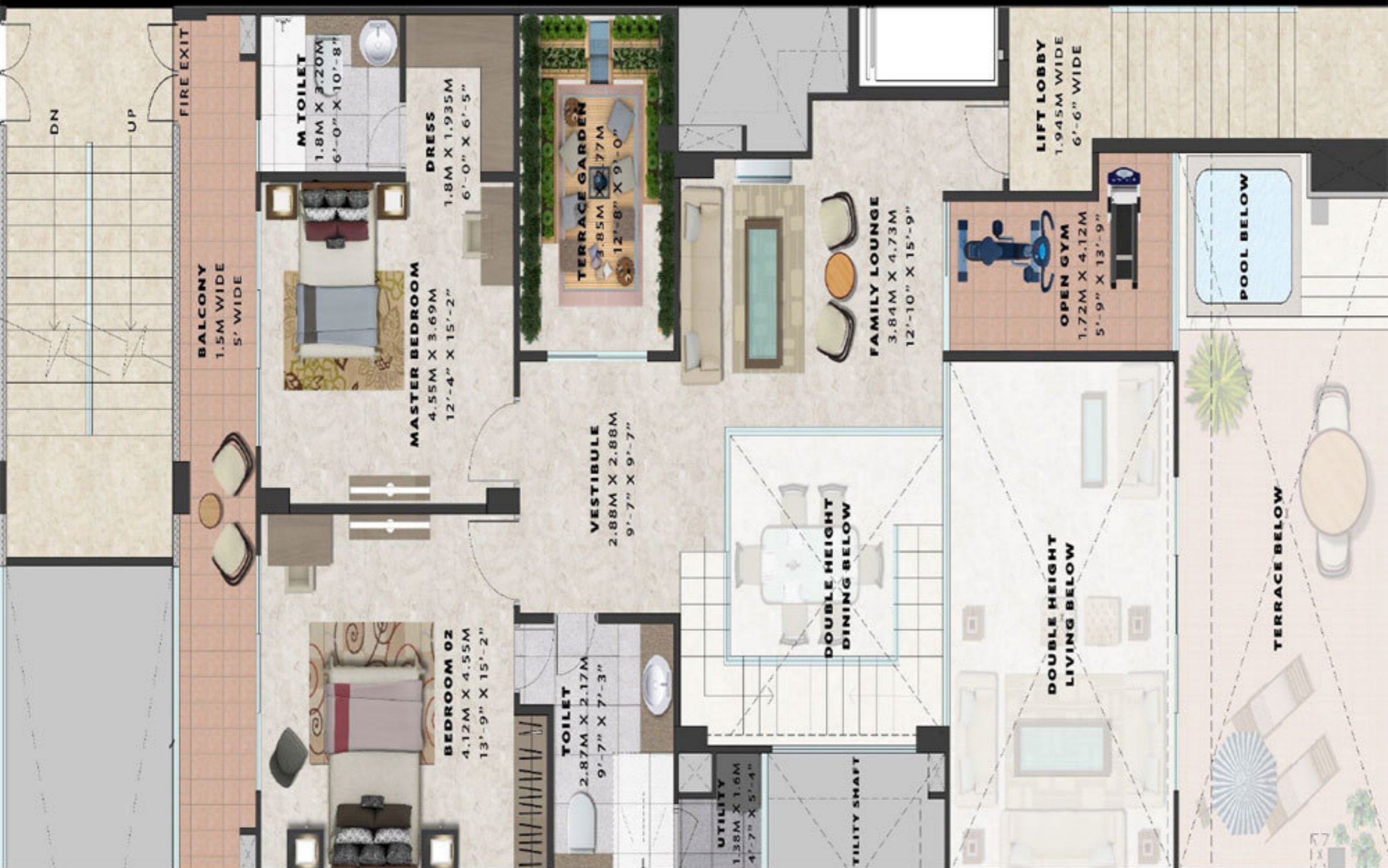
Upper Floor (6 th )