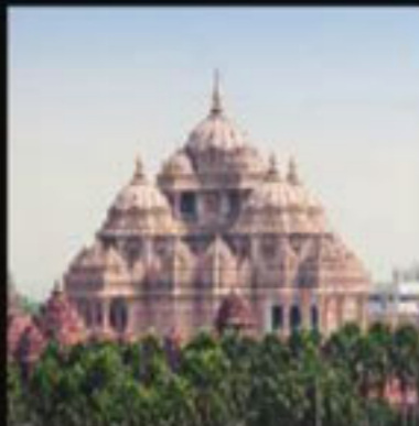
30 minutes away from Akshardham Temple, Delhi