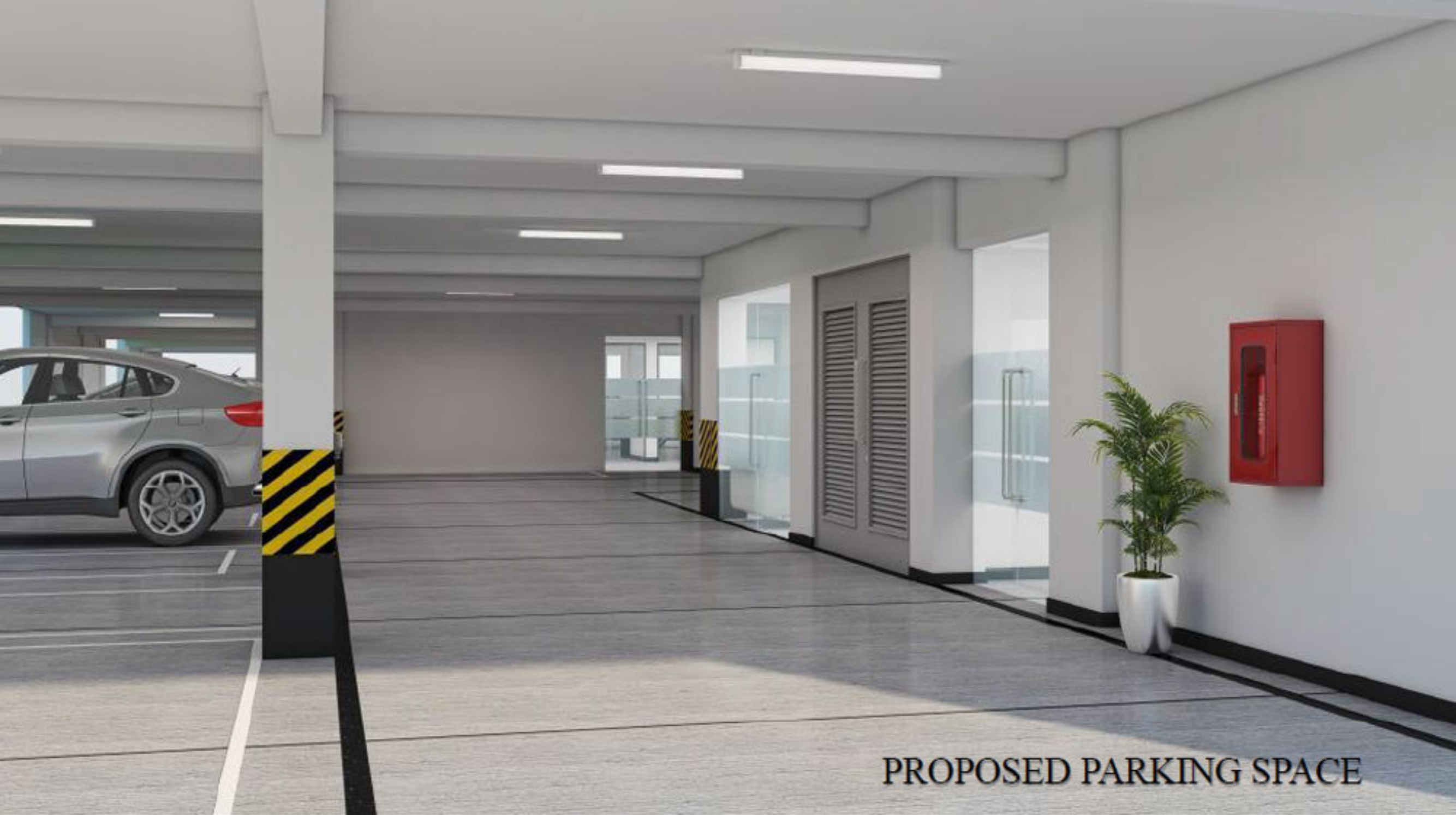
PROPOSED PARKING SPACE