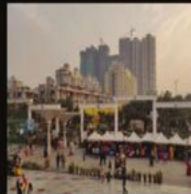
15 minutes from Indirapuram, Ghaziabad