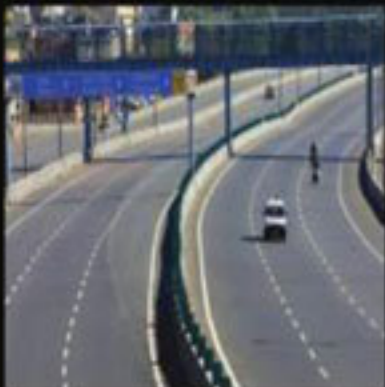
Located at 14 lane NH-24