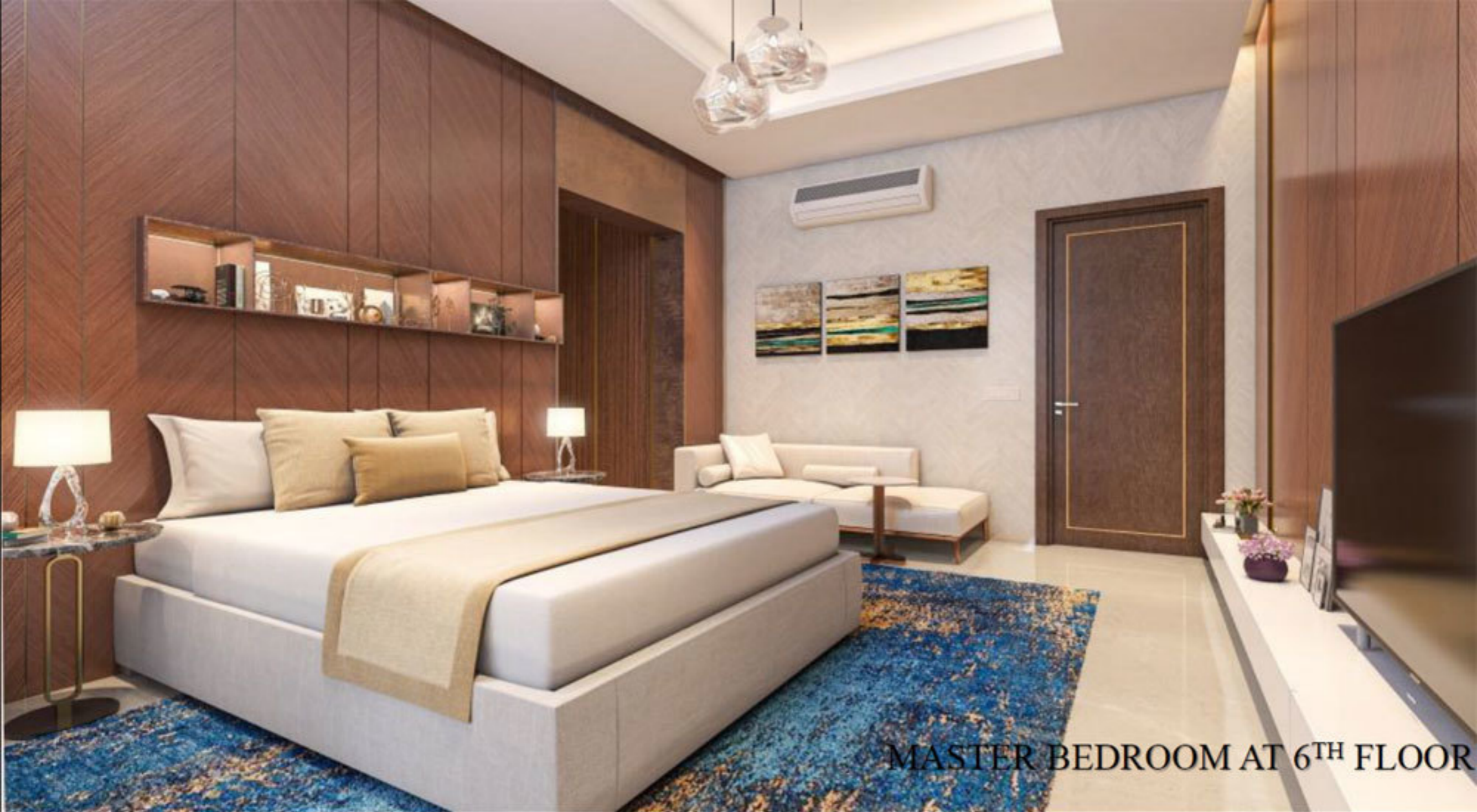
MASTER BEDROOM AT 6 TH FLOOR