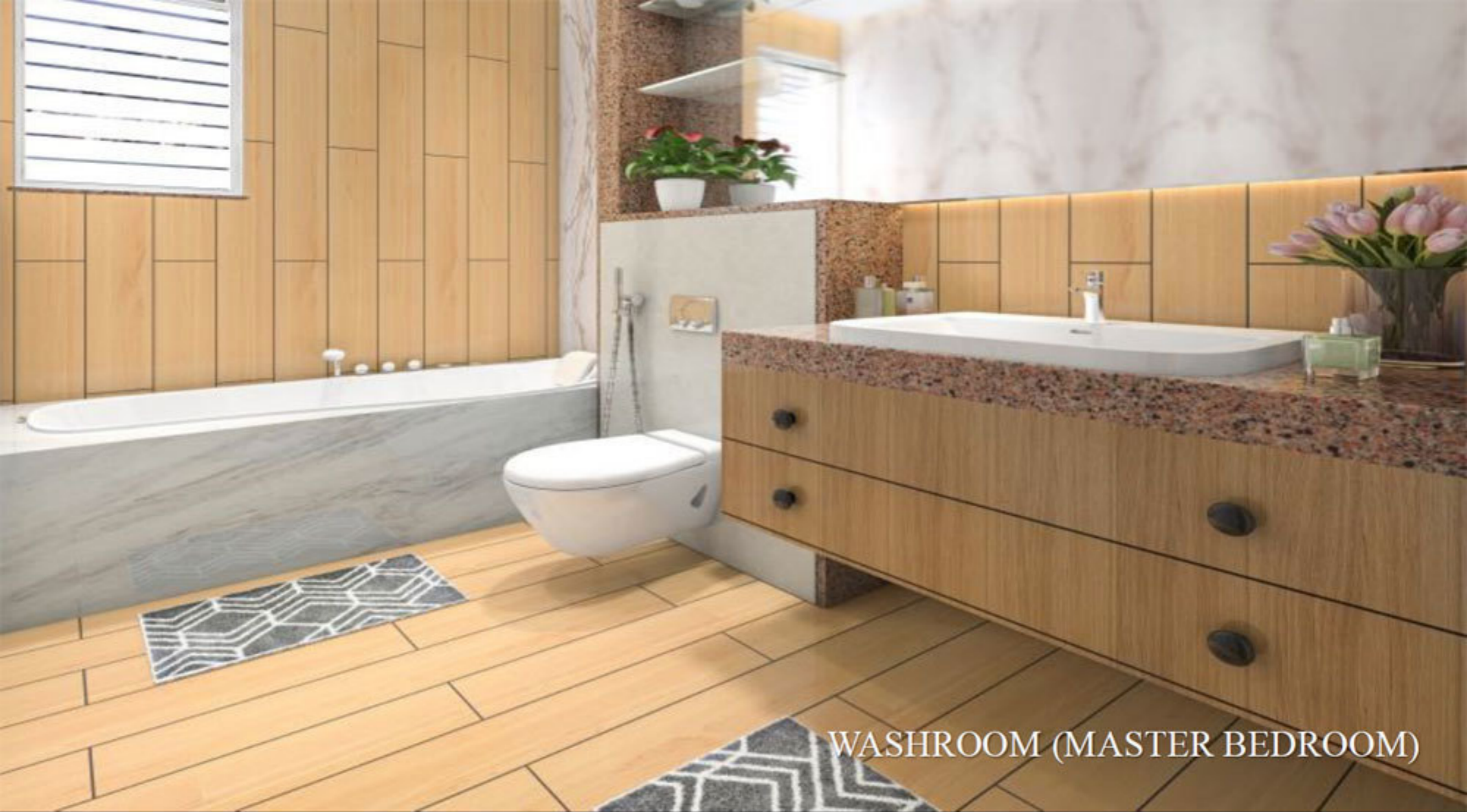
WASHROOM (MASTER BEDROOM)