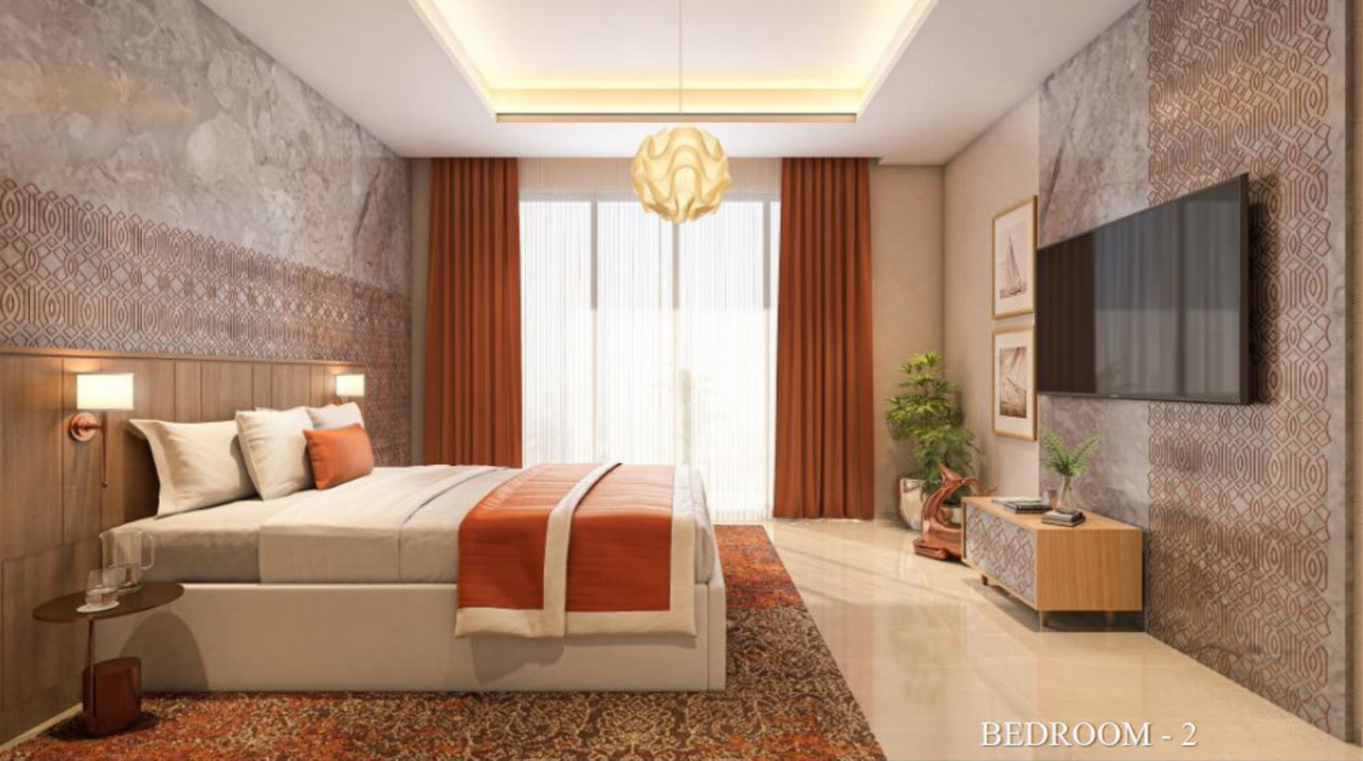
BEDROOM - 2