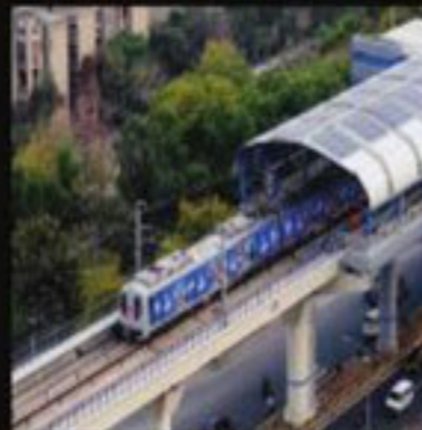
15 minutes from Noida, Sector-62