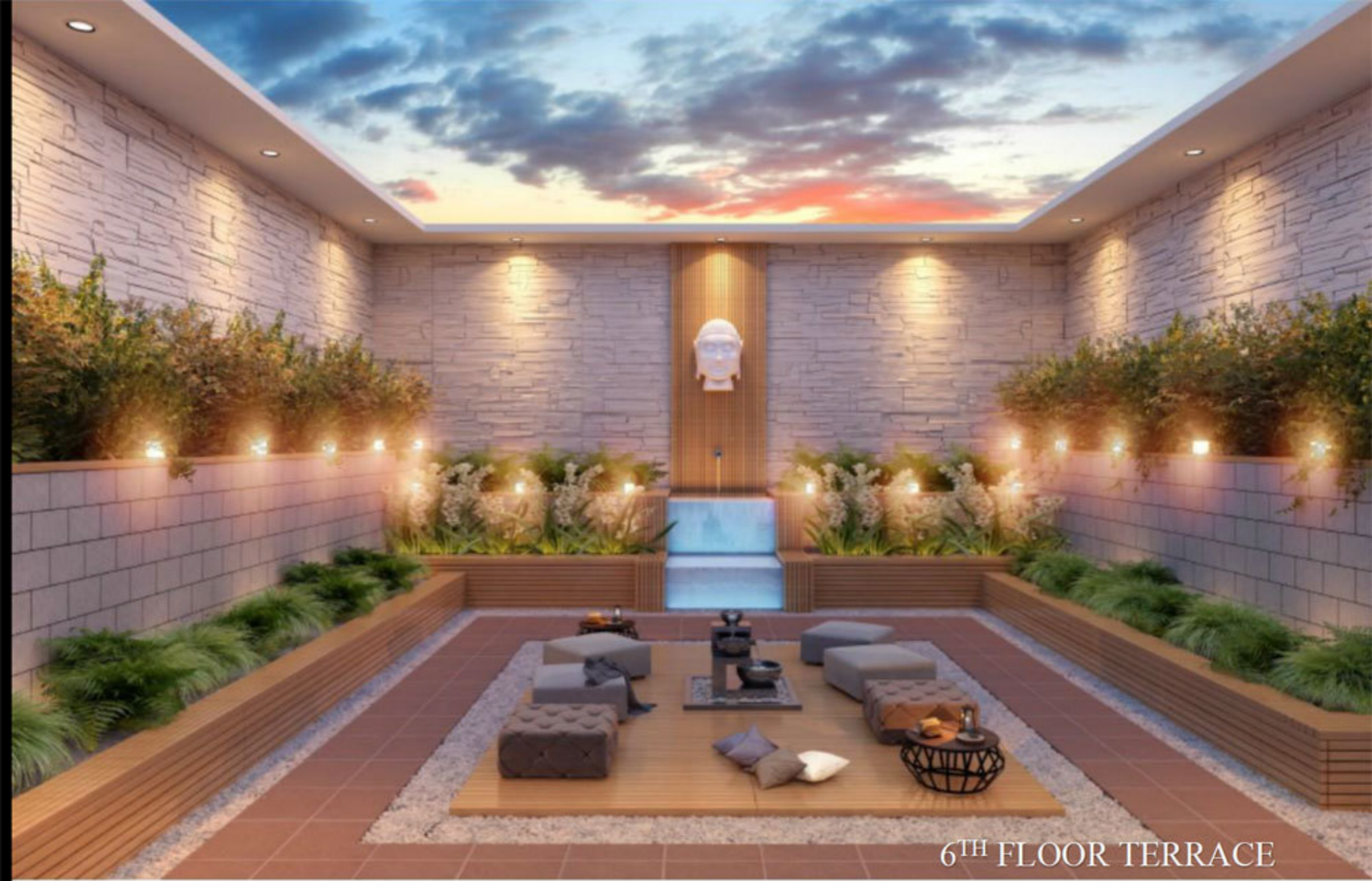
6 TH FLOOR TERRACE

☑ Sky garden at 6 th floor terrace with vitrified tiles, pebbles & planters