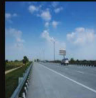
6 minutes from Eastern Peripheral Expressway