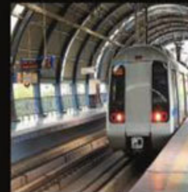
5 minutes from proposed metro station