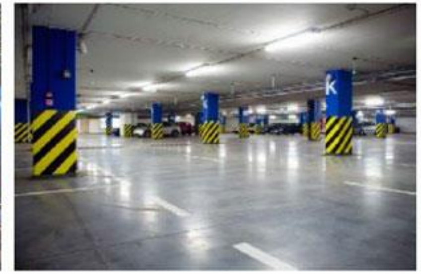
Basement & Surface Parking